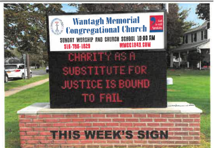
THIS WEEK'S SIGN